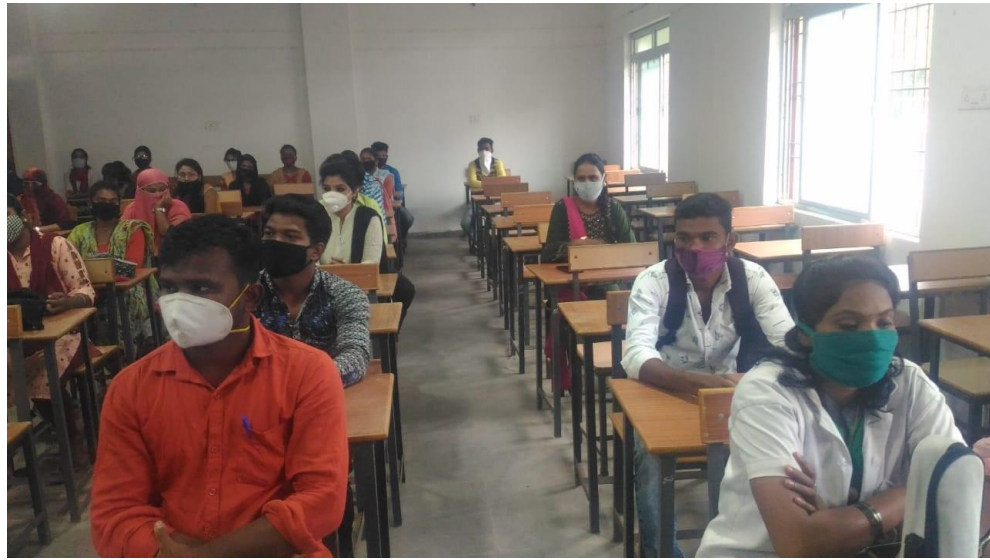
Covid-19 Awareness Program