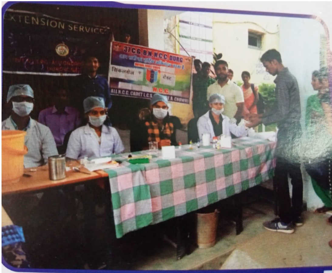
Sickle Cell Anaemia Testing Camp