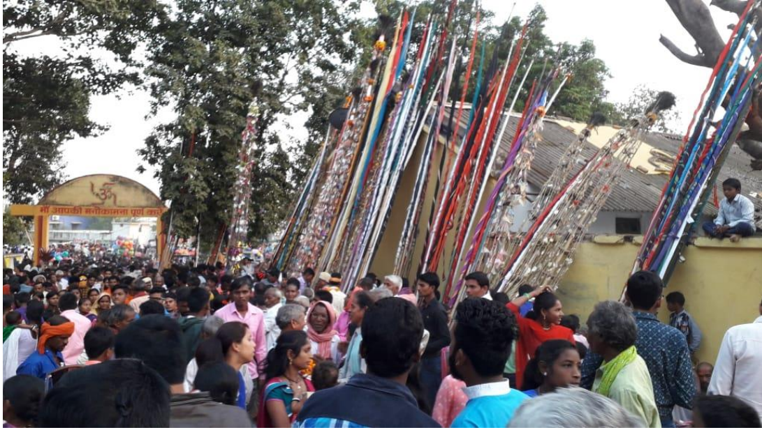
Mandai Mela Fair