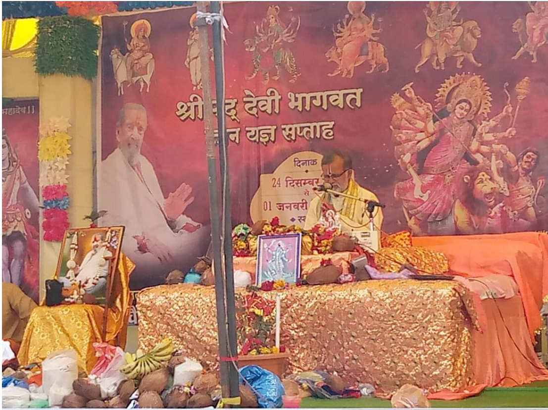
Bhagwat Gita Gyan Saptah