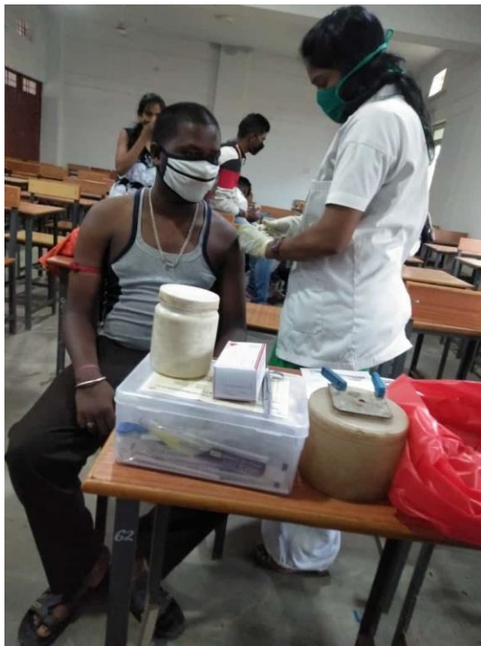
Covid-19 Awareness and Vaccination Program