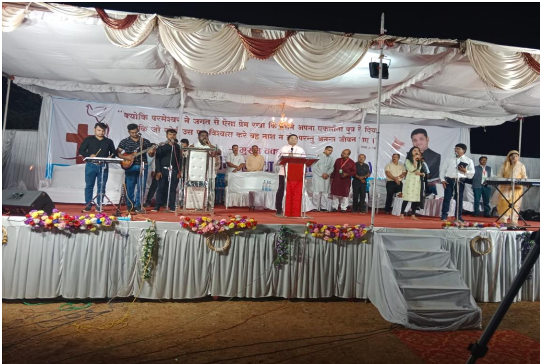
Christian Community Function